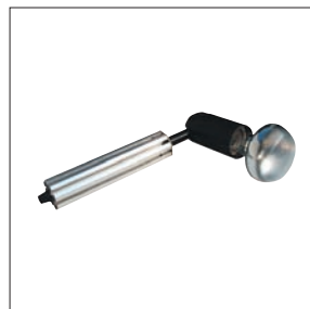
Connecting spotlight OCTANORM EUR 21.00 Code 019.010.187.000