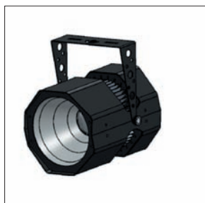
LED VIRGO reflector EUR 55.00 40W 4350 LM 4100 K Code 019.010.200.045