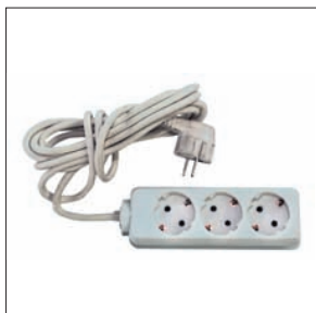
Extension cable, 230 V, EUR 18.00 10A, 3m Code: 019.010.277.000

BABY BOOM SHOW FEBRUARY 29 TH - MARCH 3 RD 2024 HALL B2, ROMEXPO