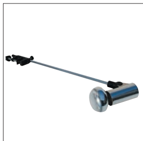
Arm spotlight EUR 21.00 Code 019.010.180.000