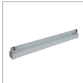
Fluorescent lighting SS30 EUR 27.00 type with D-170-A tube Code 019.010.190.001