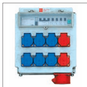
Electrical panel Octanorm EUR 210.00 Code 019.010.275.000