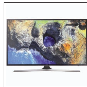
TV SAMSUNG UHD EUR 85.00/day (diagonal screen: 163 cm) Code 025 010 130 047