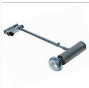
Arm spotlight 100W EUR 21.00 Code 019.010.181.000