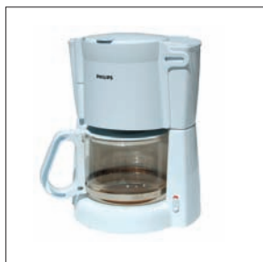
Coffee maker EUR 10.00 Code 025.010.120.010