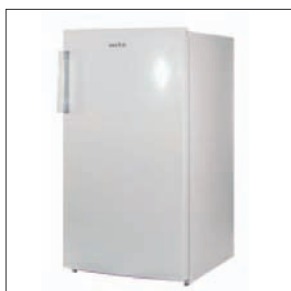
Refrigerator ARCTIC FB155 EUR 36.00 Code: 025.010.020.198