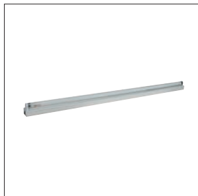
Fluorescent lamp FIA with complete electric installation 1x40W EUR 24.00 Code 019.010.110.000