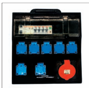
Electrical panel 380V/220V EUR 210.00 Code 019.010.265.000