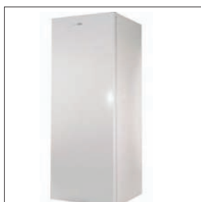
Refrigerator ARCTIC 255i EUR 80.00 Code: 025.010.029.199