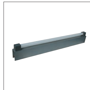
Fluorescent lighting SS30 EUR 24.00 type with D-170 tube Code 019.010.190.000