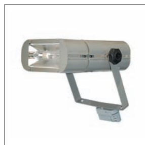
IVEN HQI 150W reflector EUR 50.00 Code 019.010.200.005