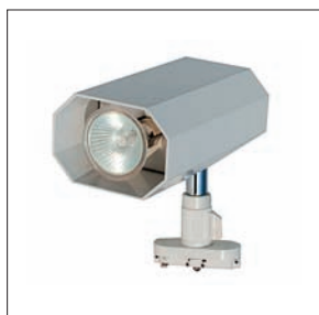
Halogen spotlight 100W SY STAR 50W (A) EUR 24.00 Code 019.010.186.000