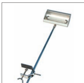
Arm reflector 300W EUR 50.00 Code 019.010.200.010