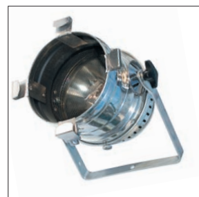
PAR64 500-1000W reflector EUR 55.00 Code 019.010.200.020