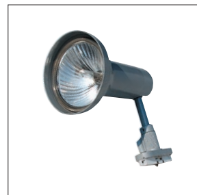
Halogen spotlight SY STAR EUR 24 cod 019.010.185.000