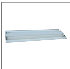
Fluorescent lighting OCTANORM type with double-tube D-171 EUR 29.00 Code 019.010.200.000