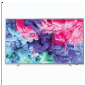
TV LED SMART 4K, EUR 55.00/day UHD ultrathin (diagonal screen: 126 cm) Code 025 010 130 045