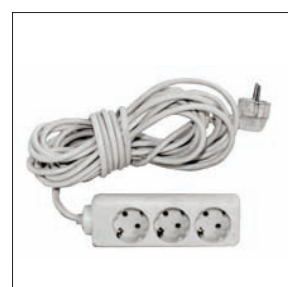
Extension cable 230V, 10A, 5m EUR 18.00 Code 019.010.279.000